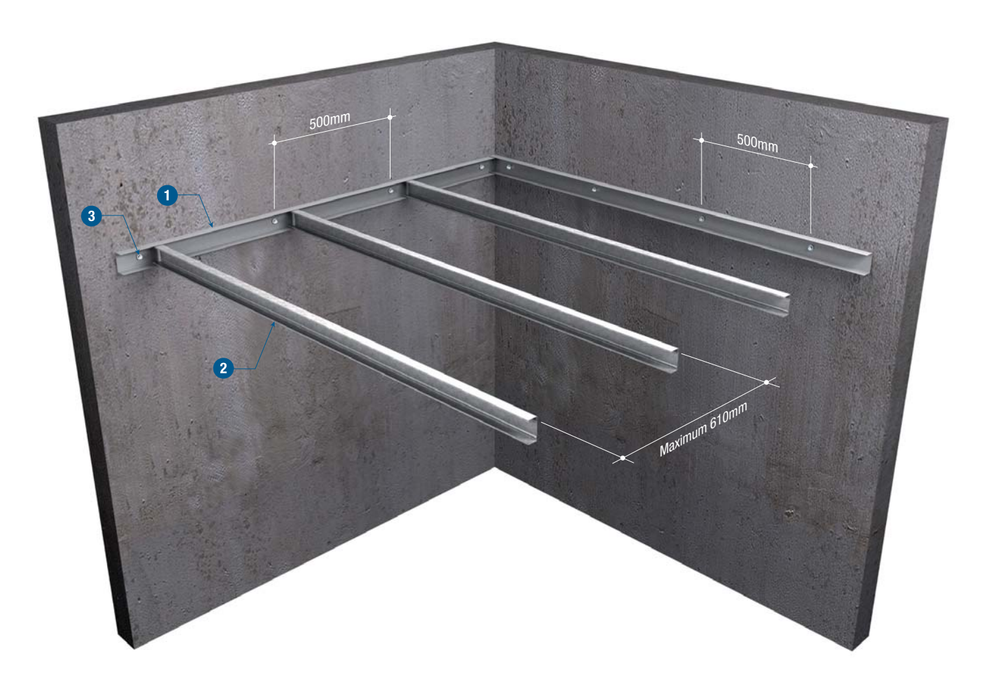
Fixing of primary and secondary profiles