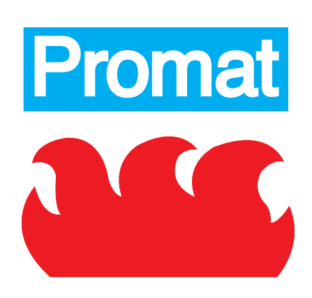
PROMATECT®-S Self-supporting Ceiling Membrane – Type 1